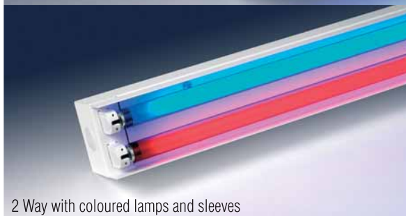
2 Way with coloured lamps and sleeves