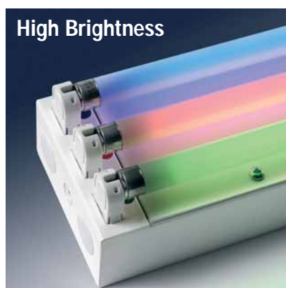
3 Colour T5 DFB with no colour sleeves. Full colour control with high brightness.