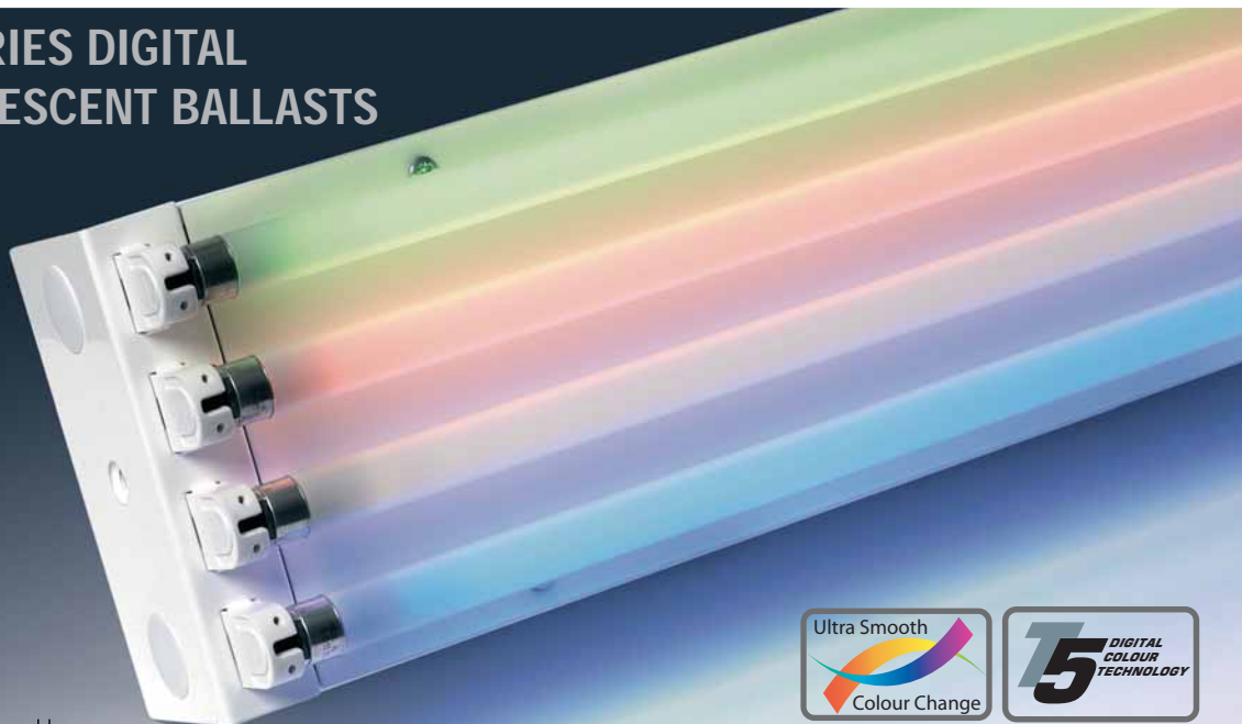
4 Way with coloured lamps