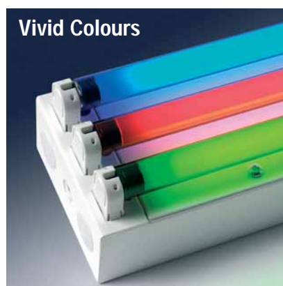
3 Colour T5 DFB with RGB colour sleeves. Full colour control with wide range of vivid colours.