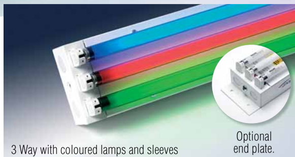
3 Way with coloured lamps and sleeves